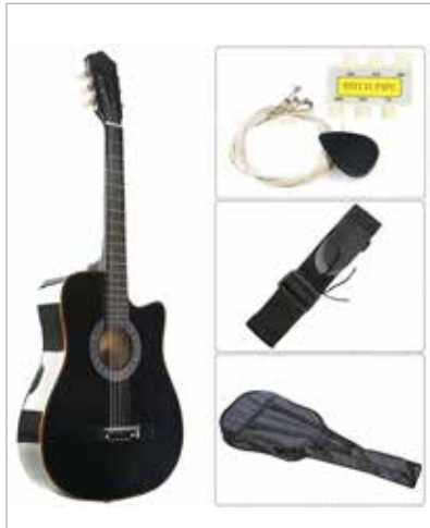
Beginner Acoustic Guitar Bundle