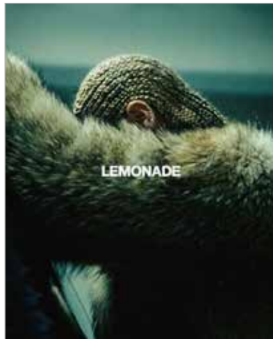
Lemonade CD by Beyonce $11.86