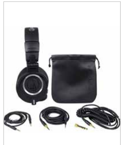
Headphone Bundle Under $129.95