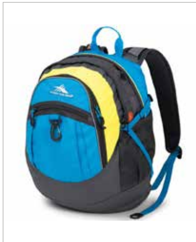
High Sierra Backpack $14.99