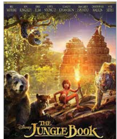
The Jungle Book DVD