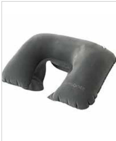
Samsonite Neck Pillow $6.99

For more information on hot items across categories, download the Holiday Hot List from the Holiday Selling Hub .