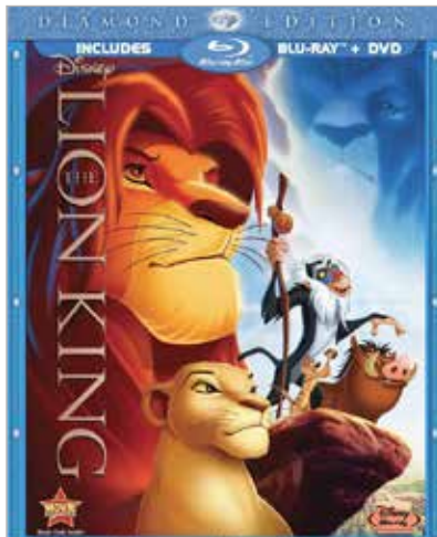
The Lion King Blu-ray DVD