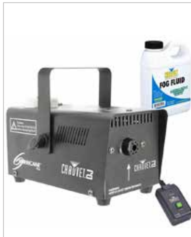
Halloween Fog Machine and Fluid $34.40