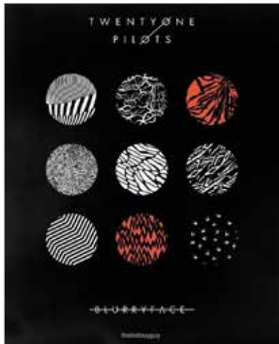
Blurryface CD by Twenty One Pilots $8.49