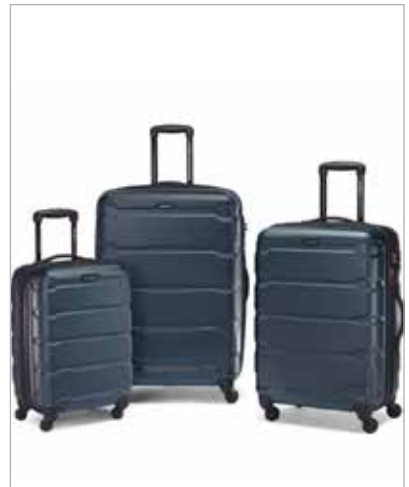
Samsonite Hard-Side 3-Piece Sets $269.00