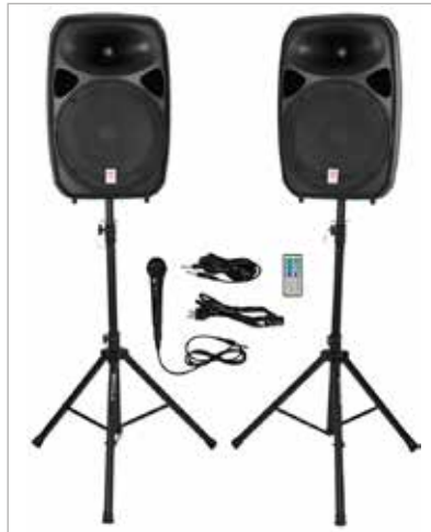
Speaker and Microphone Bundle