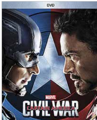
Captain America Civil War DVD