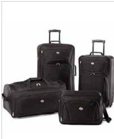
American Tourister 4-Piece Luggage Set $60.00